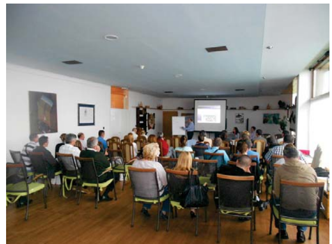
Working atmosphere from the First Workshop