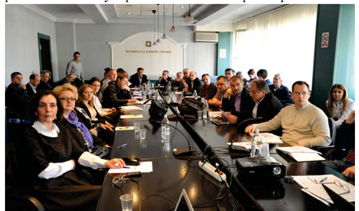
Working atmosphere from introduction meeting

Introductory meeting was held on April 7 th in Belgrade, with presence 16 utility representatives i.e. 33 participants.