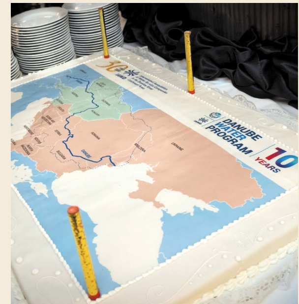
30 YEARS OF IAWD AND 10 YEARS OF DWP BIRTHDAY CAKE (2023)