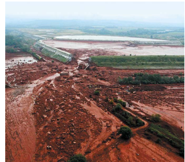
RED SLUDGE CATASTROPHE IN HUNGARY (2010)

Due to an erroneous interpretation of an ancient Maya calendar, many people expect the world, or at least human civilization, to end on 21 st December of the year. Not given to that kind of pessimism, IAWD hosts the IWA Utility Management Conference in Vienna. 120 participants from 18 nations discuss risk- and crisis-management cases and utility management in times of a sluggish economy. Those who were there enjoy their time and promise to be back next year – provided the word is still standing.