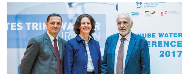
SIGNING OF MOU WITH IWA (2017)

During the 2018 Danube Water Conference, IAWD and the Danube Water Program organize a Danube Regional Young Water Professionals (YWP) Workshop, inviting fourteen participants representing 11 countries to explore the opportunities and challenges involved in creating national YWP chapters and the potential supporting roles of organizations such as IAWD and IWA. This is the second meeting of its kind, and a direct result of a recently signed Memorandum of Understanding with the International Water Association.