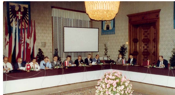
FOUNDING MEETING OF IAWD IN THE VIENNA CITY HALL (1993)

IAWD has now 30 full members, 4 associate members and 3 supporting members, covering an area inhabited by 21 million people, a quarter of the region's population. Efforts to reach out to former Eastern Bloc countries are ongoing, but political and economic change happens at vastly different speeds, and utility companies are in poor economic shape, sometimes unable to cover even a relatively moderate membership fee. But IAWD gains traction. Membership applications keep coming in encouraging numbers.