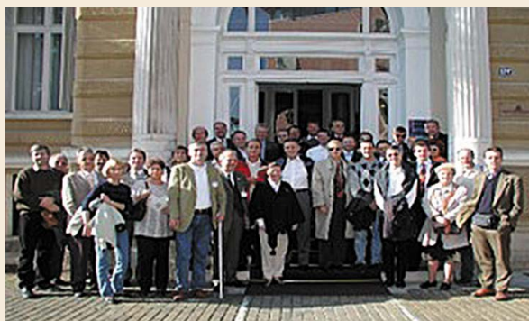
DRINKING WATER SYMPOSIUM IN OPATIJA (2002)

No big conferences. No spectacular innovations. And, gladly, no disasters to report. IAWD engages in unspectacular daily business, adding members slowly, but steadily expanding the network.