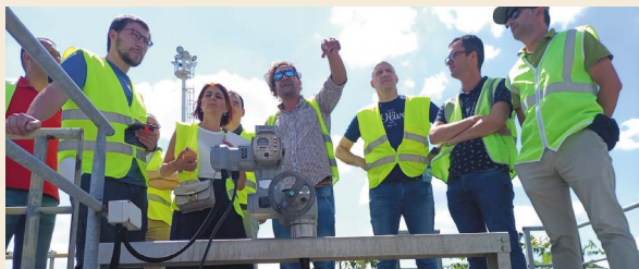
UTILITY MANAGEMENT TRAINING (UMT) IN ALBANIA (2022)

IAWD takes a long hard look at its web landscape and decides to create a new Voice of the Danube web. It delivers the content of formerly four webs in one clear structure, providing everything from latest news to vital services. The timing is perfect, because short before the launch, Covid-19 brings travel, conferences and congresses to a screeching halt and creates exploding demand for digital communication. IAWD goes digital and even holds the first Danube Water Forum in the virtual space.