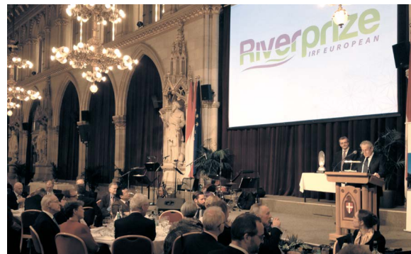
EUROPEAN RIVERPRIZE AWARDED IN VIENNA (2016)

The prestigious European Riverprize 2016 goes to the Segura River Restoration Project in Spain. The award ceremony is held at Vienna City Hall, with support from IAWD, in the context of the European River Symposium, a three-day event with focus on all things related to river management. One month later, IAWD signs a MoU with NALAS, the Network of Associations of Local Authorities of South-East Europe.