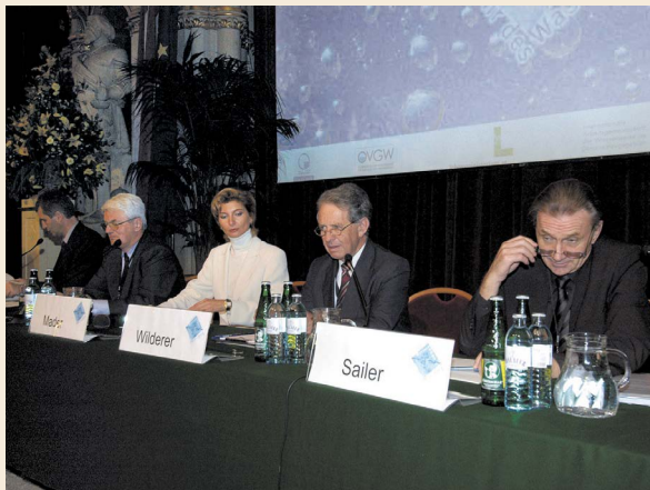
IAWD SYMPOSIUM THEMED WATER IN THE DANUBE REGION (2003)

It's the United Nations' International Year of Freshwater. IAWD marks its 10 th birthday with a Symposium "Water in the Danube Region". 430 delegates gather at Vienna City Hall to take stock of the status quo and discuss future strategies. The event's success gives the organizers confidence to tackle a hugely important future task: During the March 2003 World Water Forum in Kyoto and Osaka, Vienna had made a successful bid to hold the IWA World Water Congress 2008. This would turn out to be a milestone for IAWD and the region, propelling our community and activities into international spotlight.