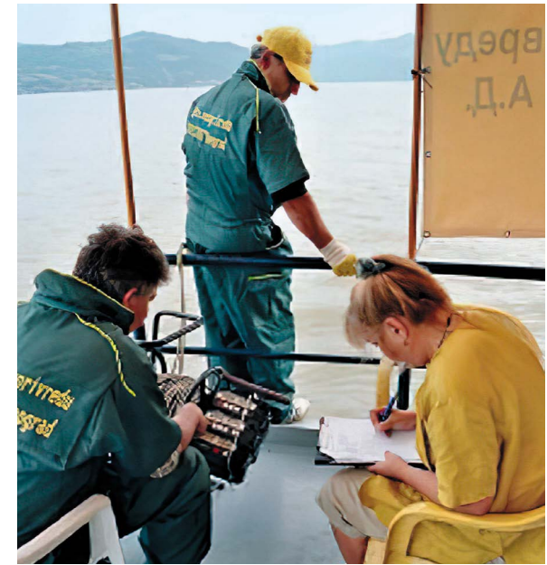
IAWD TECHNICAL-SCIENTIFIC COMMITTEE ON THE DANUBE (1994)