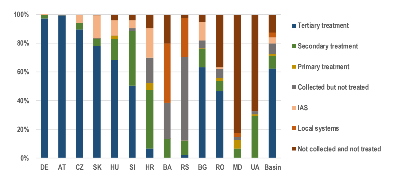
Figure 1: Share of the collection and treatment stages in the total population equivalents at agglomerations above 2,000 PE in the Danube countries (reference year: 2016)

the countries in the middle-basin (nutrient removal is still needed at certain agglomerations above 10,000 PE, small agglomerations are lagging behind) whilst significant proportions of the generated loads are not collected or collected but not treated in the downstream states indicating substantial investment needs.