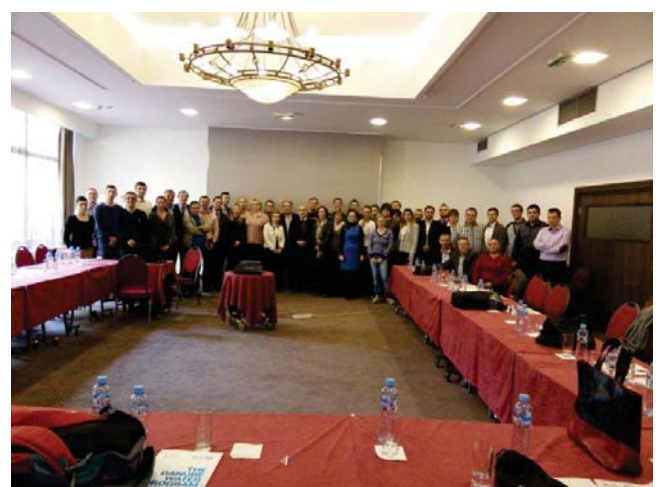
Group photo from the Second Workshop

Second Workshop was held on November 3<sup>rd</sup> in Belgrade, SR, with IAWD representative (Kling, Weller, Wagner and Wolff), and presence 16 utility representatives i.e. total 43 participants.